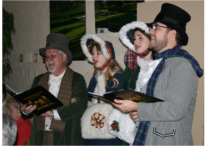
The Dickens Carolers delighted members with their cheery and animated Christmas music.

Gifts were provided by chapter officers and committee heads, and some members even donated a few. Most important, all proceeds from the ticket sales – totaling $352 – went to the Scholarship Fund.