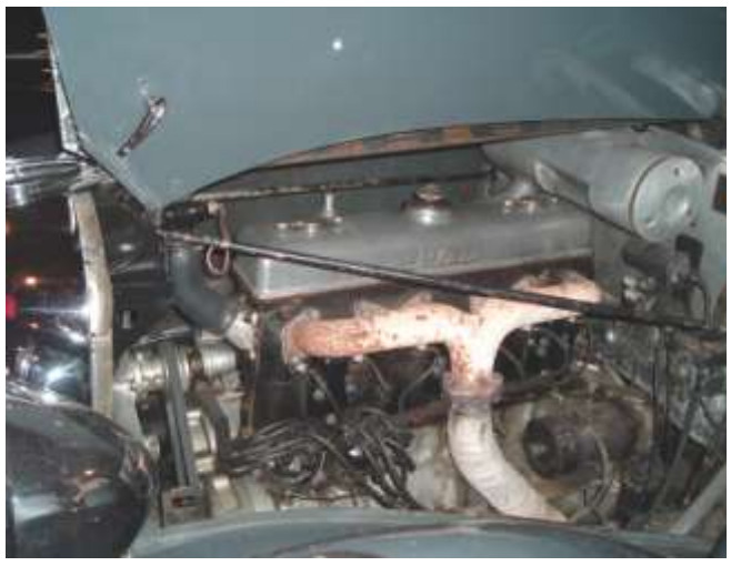
This rare Lagonda has a dual ignition system