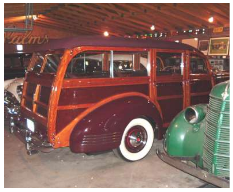
Woody Station Wagon