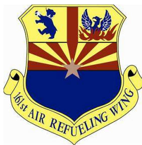
Lt Col Hoyt Slocum described the 161st ARW's many activities, anchored by its 8 KC-135R refueling tankers.