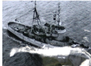
Jim's "ghost ship"

He got permission to try to get ahead of the storm, but it caught up with the ship. Soon the craft was fighting 30-foot swells that steadily grew to 40, then 50, then 60-65 feet.