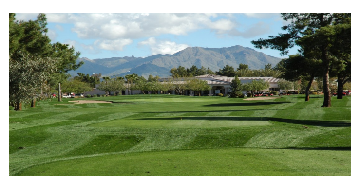
Star Fire 9th Hole with club house in background

Saturday March 17, 2018 McCormick Ranch Golf Club $25 REGISTRATION must be received by 4:00 p.m. Tuesday, March 13