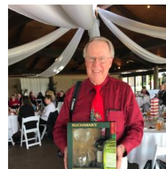
Did Jim steal that Buchanan or was he just fortunate enough to find it?