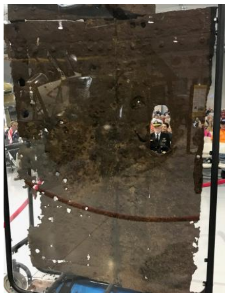
“Sacred Steel” from USS Arizona (note Jack Farley, in uniform, through hole in the piece of steel) at the Arizona Commemorative Air Force Airbase in Mesa on December 7, 2019.