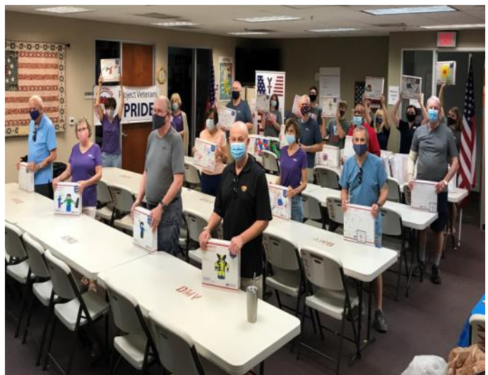
Volunteers w/finished boxes ready for the Post Office