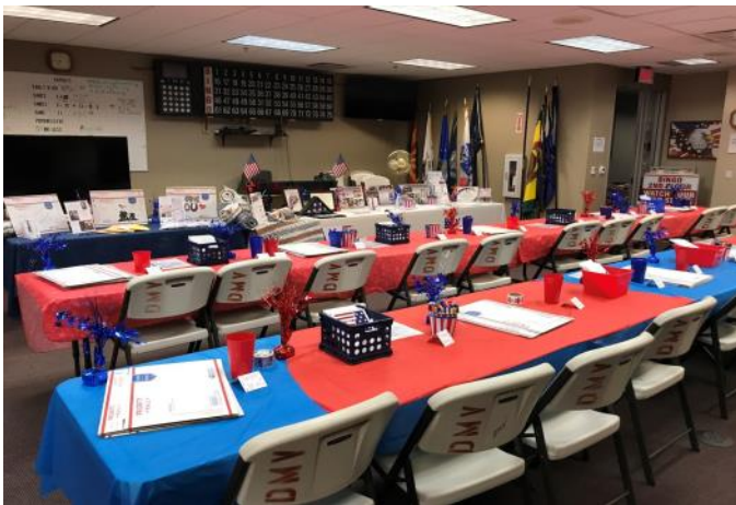
Pre-event room set up by YFT in Anthem, AZ

Our special thanks to Youth for Troops for helping make these events possible and successful.