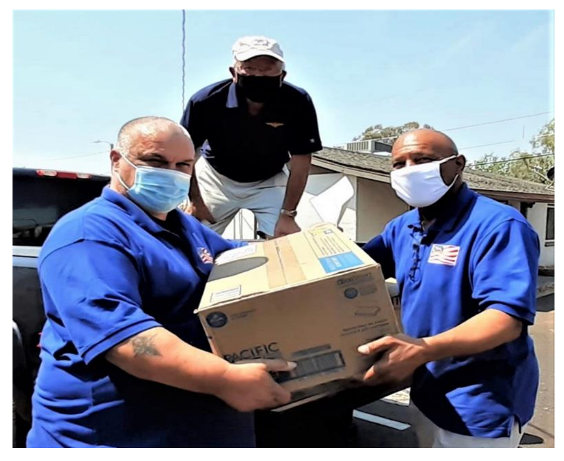
Delivering supplies to the James Walton Home