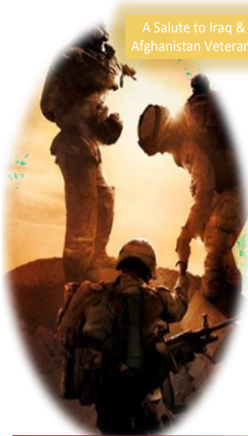
A Salute to Iraq & Afghanistan Veterans